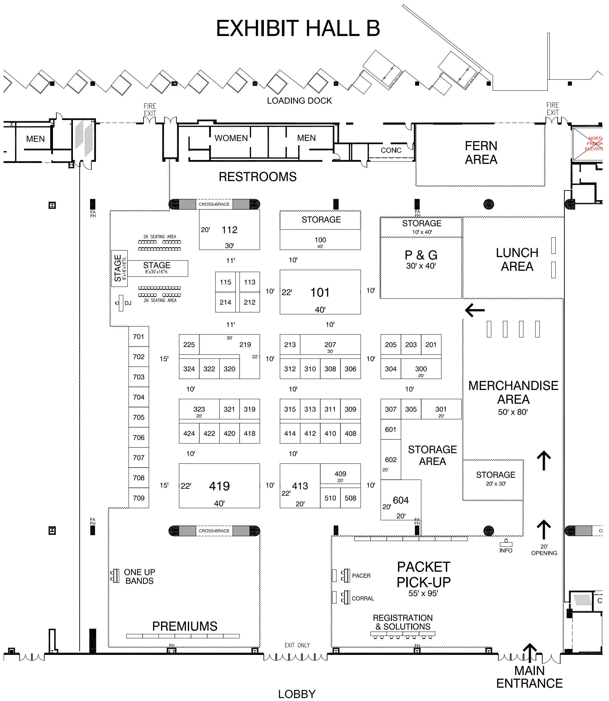
EXHIBIT HALL B